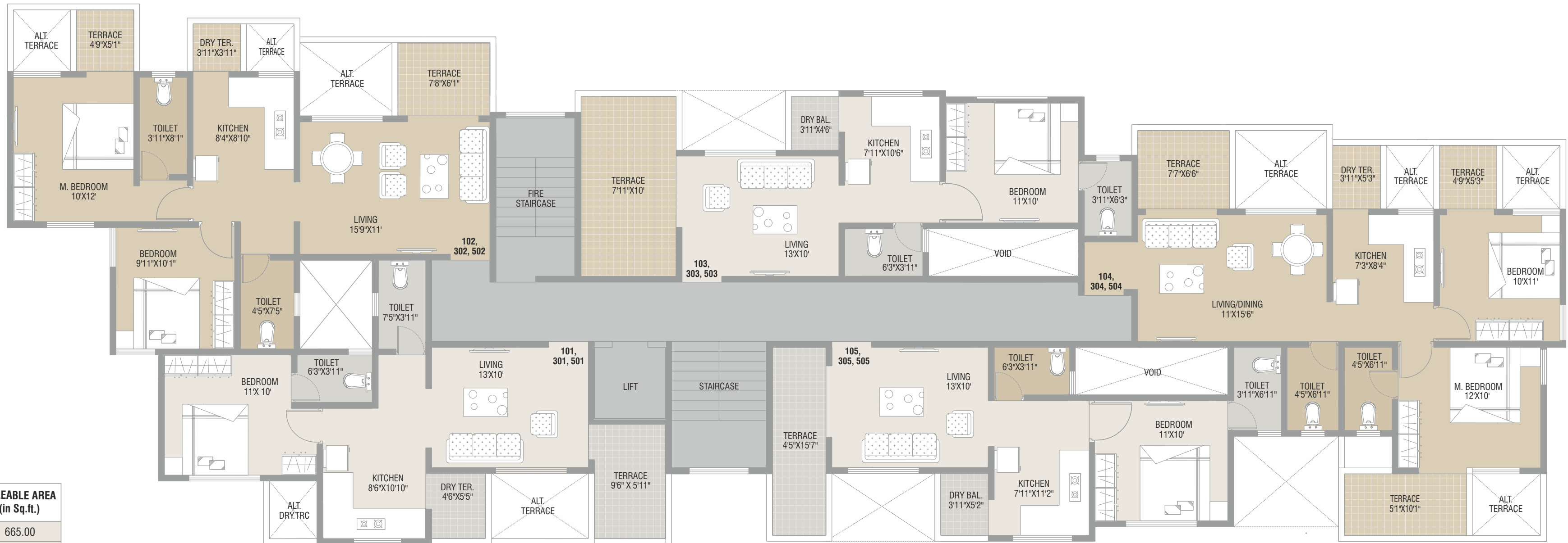
1st, 3rd, 5th FLOOR PLAN